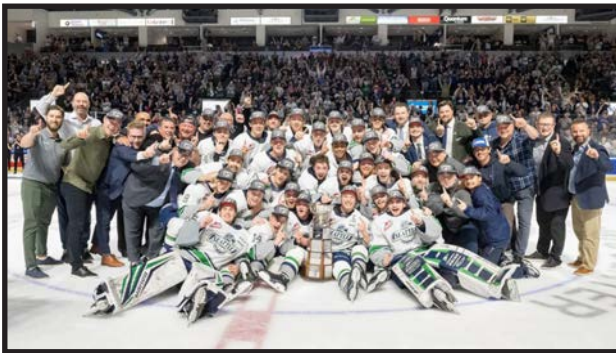
SEATTLE THUNDERBIRDS • 2022-23 Western Hockey League Champions