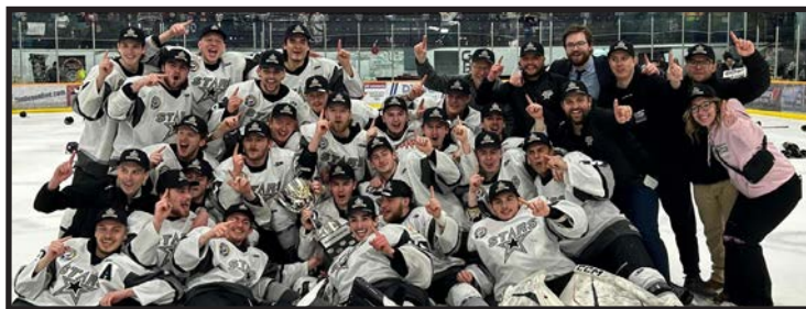
BATTLEFORDS NORTH STARS • 2022-23 SJHL Canterra Cup Champions