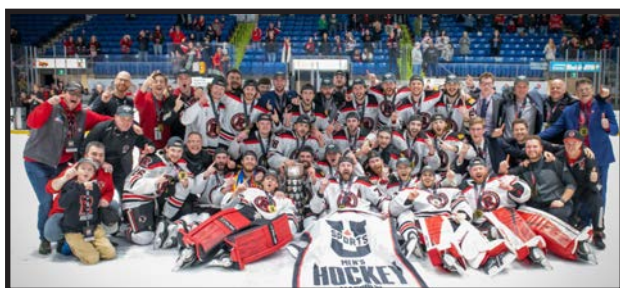
UNIVERSITY OF NEW BRUNSWICK REDS • 2022/23 University Cup Champions

For more information on U Sports, you can visit http://www.usports.ca